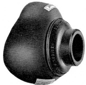
Fig. 1830A 'Everseal' facemask fitted with studs for Connell harness

The 'Everseal' facemask is registered design No. 868449 of Medical & Industrial Equipment Ltd.